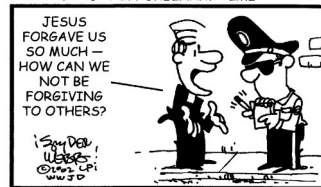
24TH SUNDAY IN ORDINARY TIME

“By our baptism, we are members of Christ’s body and sharers in his mission. Imitating Christ, we must care for all members of our communities, honoring each person as unique, sacred, and created in the image of God.”