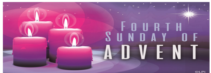
4th SUNDAY OF ADVENT