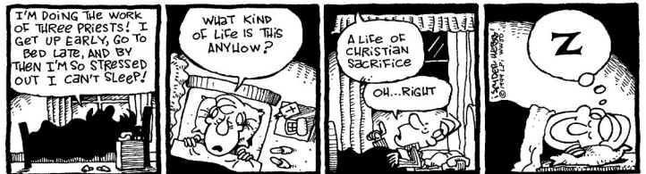
22 ND SUNDAY IN ORDINARY TIME

"No sin or crime is greater than God's mercy. The sacrifice of the Cross reveals that Christ's greatest desire is to forgive those with a repentant heart."